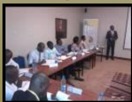
Self Branding & Superior Communications Skills