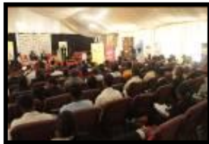
Bankers' Day Plenary Session at GHB2012