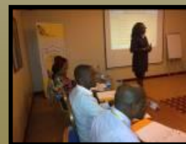
Responsibility, Authority & Accountability