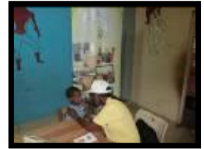
Chief Matron deworming a child