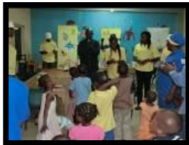
LWI entertaining the children