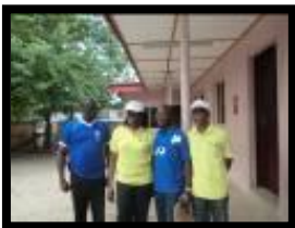
Head, Stanbic fellowship and LWI CEO

Each resident of the home was physically examined by the LWI doctors, including the new babies. Some of the babies who needed special attention were given due attention. Nutritional supplements like multivitamins and iron preparations were dispensed to the babies through their caregivers; and, one or two babies who needed de-wormed, with special medicines were duly attended to. In addition, their care takers were all given free basic healthcare tests including free blood pressure, sugar and cholesterol tests. They all felt quite rewarded and the Chief Matron in her Thank you speech, requested for a regular visit to the home by LWI, whilst thanking Stanbic IBTC for the unique opportunity. The LWI Team certified most of the babies as healthy, and the team recommended that the bank should follow up with health insurance for the babies. The Stanbic IBTC Fellowship thanked the Home for hosting the group, and, the programme ended with an exchange of pleasantries and goodwill.