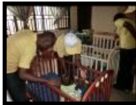
LWI doctors giving personal attention and physical examination to babies and infants