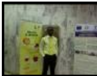
LWI Exhibition Stand at the ECOWAS, Lome