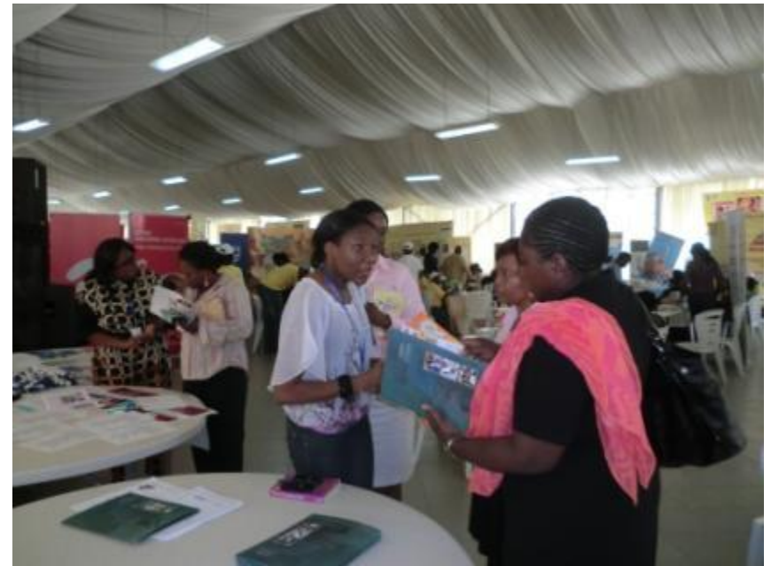
TYDF TY Danjuma Foundation Stand at GHB2011