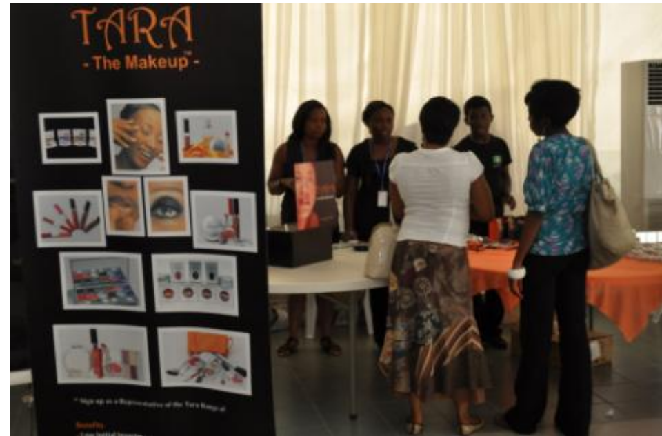
Tara Makeovers – attended to the NAN (News Agency of Nigeria) delegates