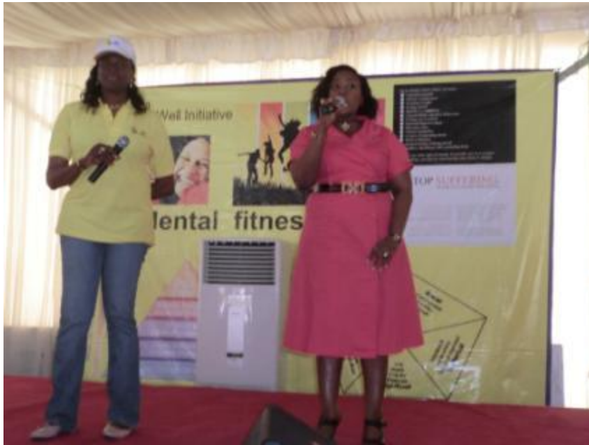
Head, Corporate Affairs Stanbic IBTC at the podium