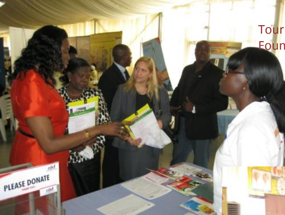
Tour of Exhibition Stands (contd) – Nathan Kidney Foundation (l) & West African Health Fair (r )