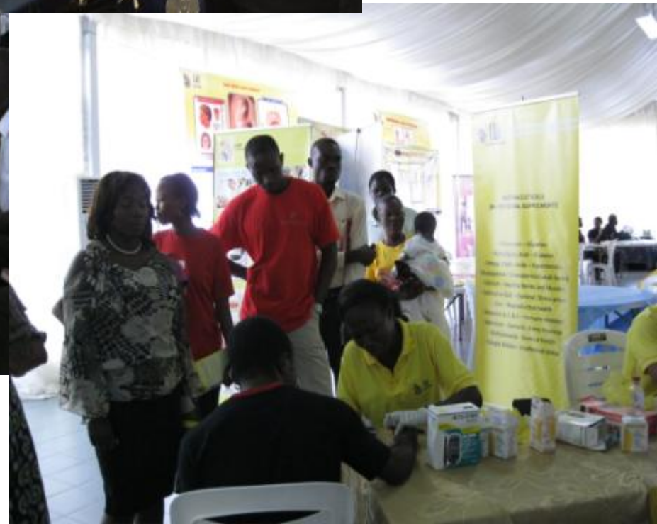
Exhibition Stands (contd) – LWI Wellness Stands