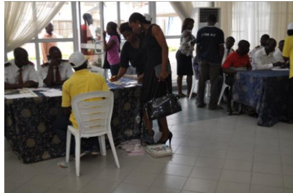
Group from NIIA