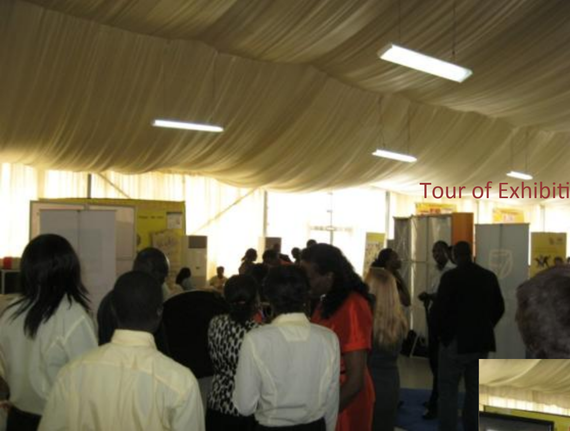
Tour of Exhibition Stands (contd) – LWI Academy, Airtel