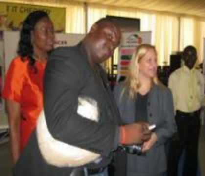
VITAFOAM Brand Manager (Health) with CEO LWI