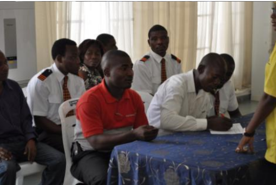
Group of GTBank Staffers