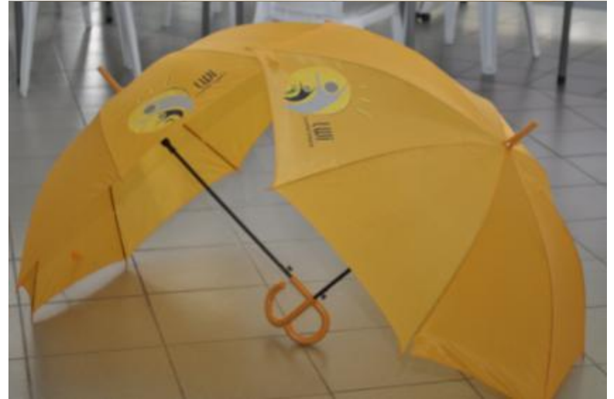
LWI umbrellas as floor décor