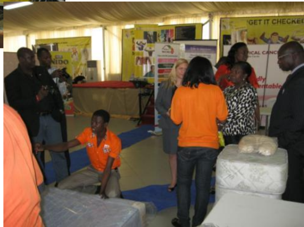
LiveWell Initiative LWI Stand at the GHB2011... and Vitafoam (partner) Stand