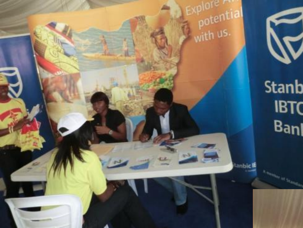
Stanbic IBTC Officers attending to LWI and Nestle