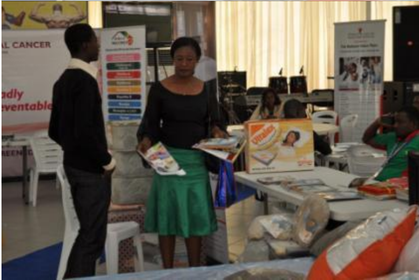
Partners – GSK, Vitafoam