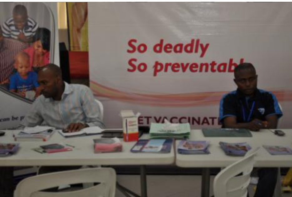
GSK / Vaccipharm ... ...promoting access to immunization