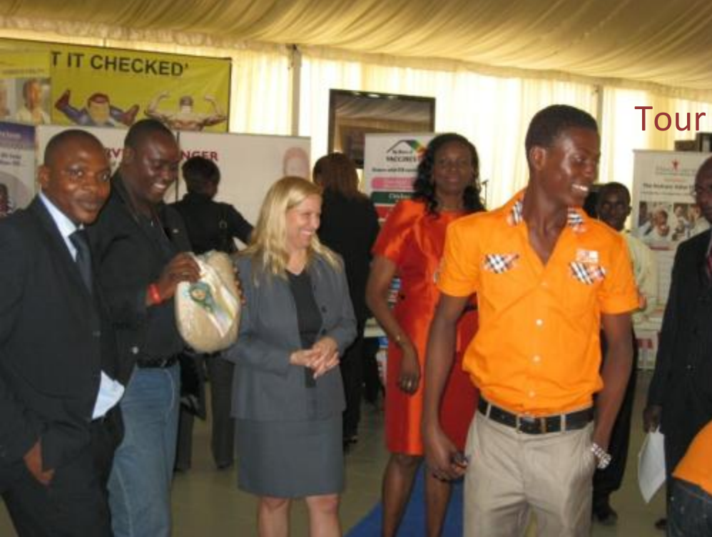
Tour of Exhibition Stands (contd) - Vitafoam