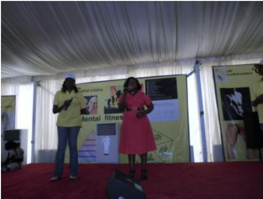
Head, Corporate Affairs Stanbic IBTC at the Podium...