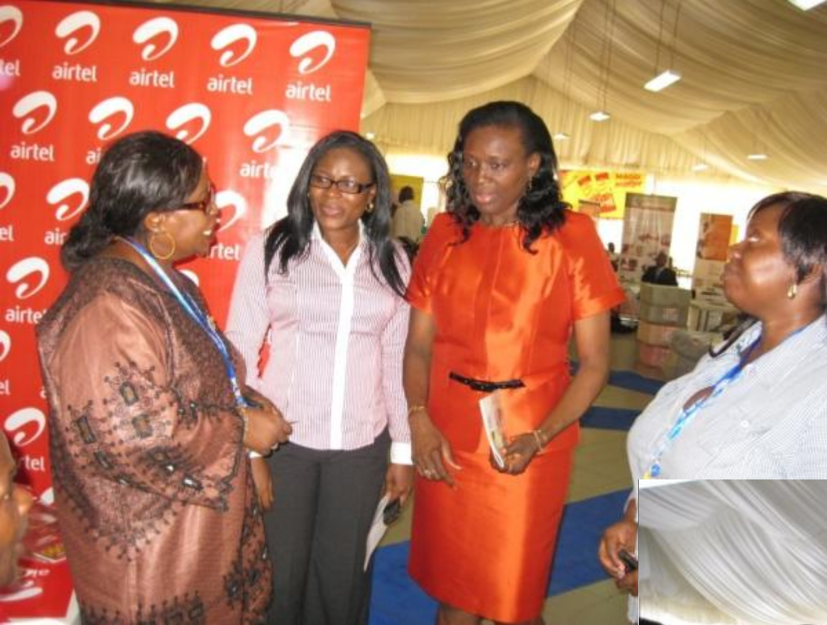
Mobitel-Millenia 2015 Talks