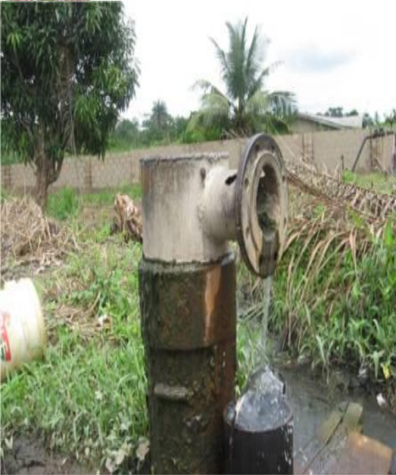
Artesian well producing warm water at Itoikin