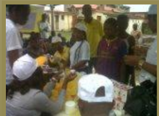
The kids being given free OTC medicines under supervision