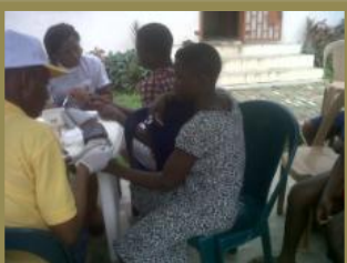
A participant (staffer) checking her Blood Glucose level