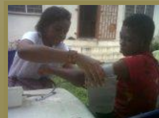
Blood Pressure Check