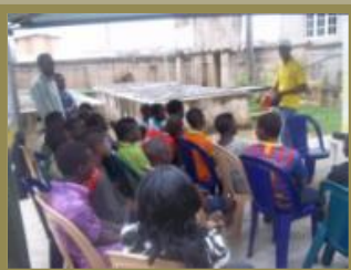
Intern (Imole) giving a lecture